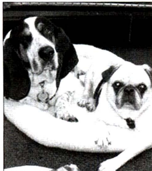
A DOG'S LIFE – Love is one of the key ingredients in the new Dogtopia center in Bayonne.

A screen showing the webcam glows in the lobby, although the only dogs in the facility are